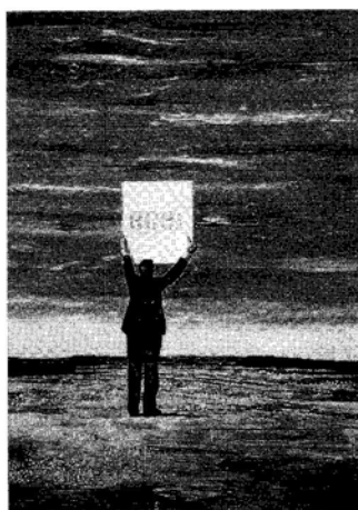
Painting by Nodjoumi